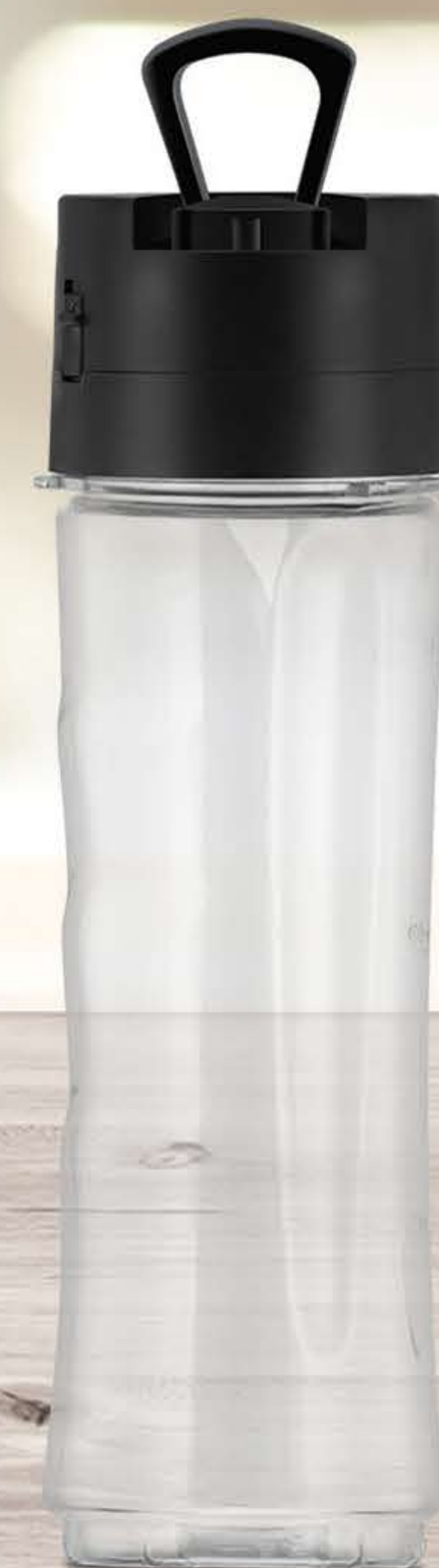
Juice Bottle With Vacuum Lid (Optional Purchase)